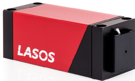
YLK-XT 61xx TS

Compact diode-pumped solid-state laser with integrated controller electronics Up to 100 mW output at 561 nm