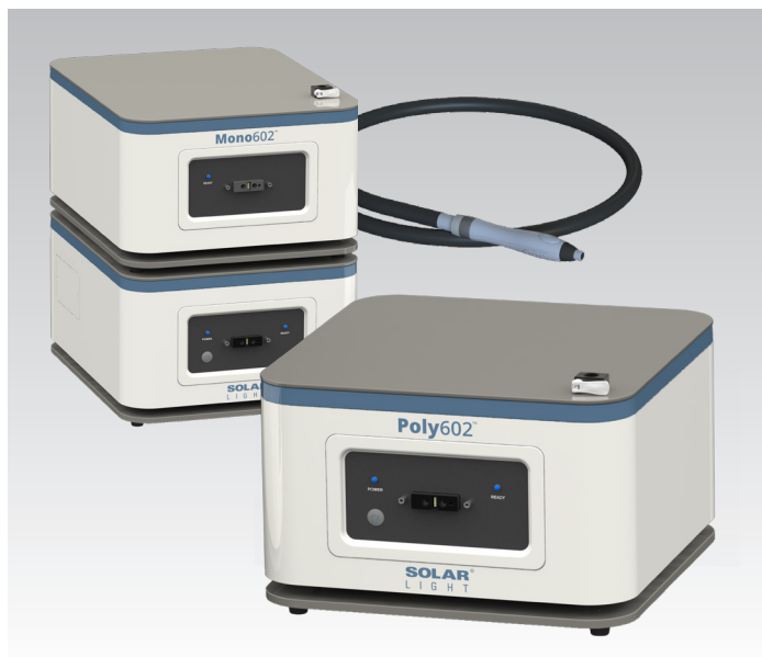
Solar Light's DRS Family - Mono602™ and Poly602™